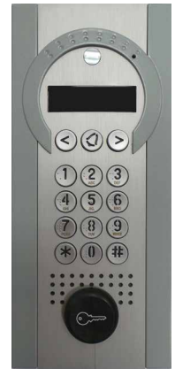
Light grey / silver finish