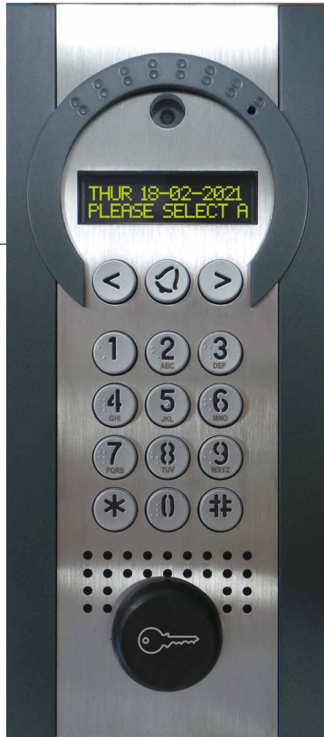
Anthracite / silver finish

VIDEO INTERCOM DESIGNED SPECIALLY FOR RENOVATIONS With name scroll, pinhole camera, 12-button backlit coded keypad and proximity reader - Flush mounting